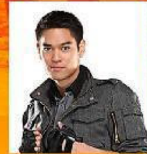
JAY R, Pinoy R&B King, singer-songwriter, actor, record producer, model and TV host.