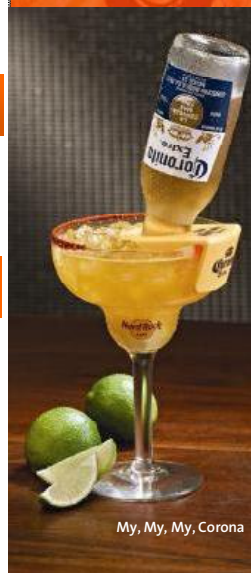
My, My, My, Corona

Get your My, My, My, Corona for a limited time only at Hard Rock Cafe!