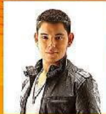
RICHARD GUTIERREZ, Kapuso star, an actor and commercial model.